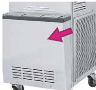
Removable & Washable Air Filter