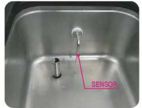
Agitator Mix out & low sensors