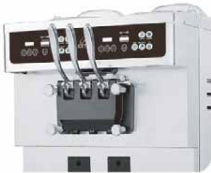
Easy to control on the front LCD touch panel