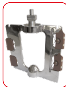
Two blade mixer