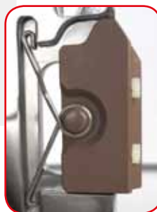
Interchangeable metal scrapers