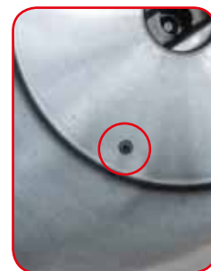
Probe in direct contact with the mix