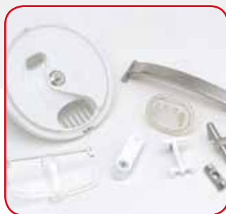
Complementary door is disassembled without the use of tools, for a perfect hygiene