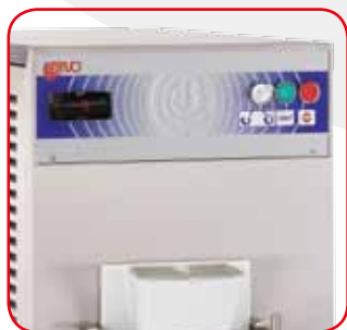
Thermo-regulator by display